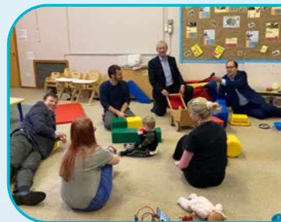
Cornwall Freemasons meet the beneficiaries of WILD Young Parents Project.

This challenging year also marks the end of the MCF five-year strategy period and they should be proud of their accomplishments so far – over 30,000 grants awarded totalling nearly £100M . The MCF is now preparing for a new phase and will announce their next strategy in the near future.■