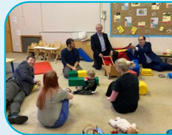
Cornwall Freemasons meet the beneficiaries of WILD Young Parents Project.

This challenging year also marks the end of the MCF five-year strategy period and they should be proud of their accomplishments so far – over 30,000 grants awarded totalling nearly £100M . The MCF is now preparing for a new phase and will announce their next strategy in the near future. ■