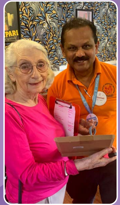
Heartfelt tokens of appreciation page 11