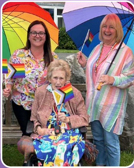
Where everyone belongs page 6

If you would like an audio version of RMBI News, please email marketing@rmbi.care