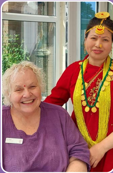
Celebrating diversity with a Nepalese culture day page 8