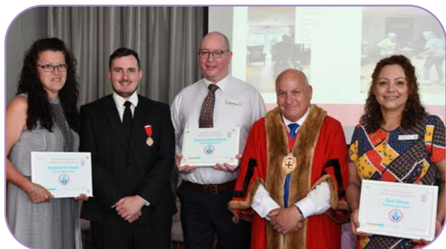
Staff at Connaught Court, in York, proudly receive their EMBRACE dementia accreditation award during a ceremony with the Lord Mayor of York.